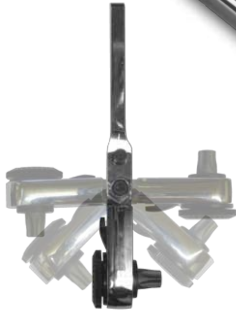
180° Locking Pivot