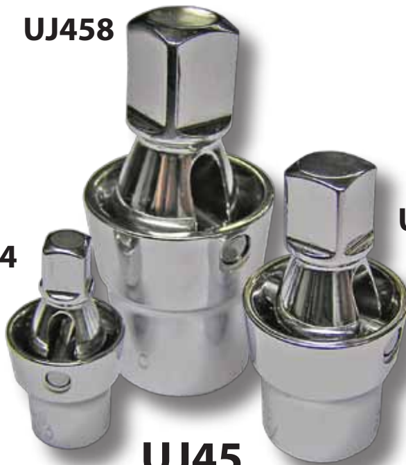
UJ45 3 Pc. Set